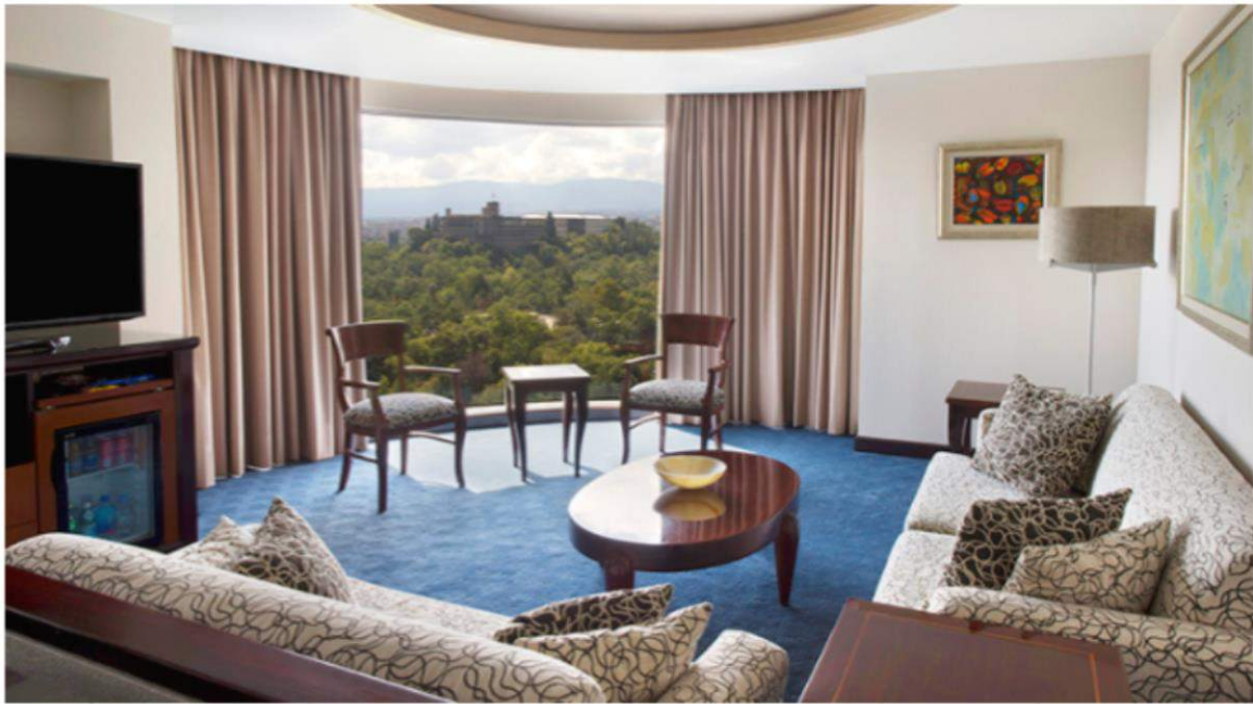
Grand Fiesta Americana Chapultepec